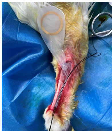
Figure 2: The strain sensor implanted in the Achilles tendon of a New Zealand rabbit leg.