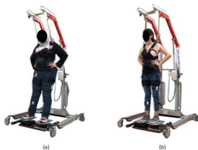
Figure 1. Standing test. (a), single-leg standing, during which subjects have to allocate more than 85% of the body weight to one side; (b), double-leg standing, during which the body weight is evenly distributed to each platform (the difference between left and right is less than 10% of body weight).