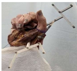
Figure 1: A photograph of one of the cadaver specimens with the marker bases attached.