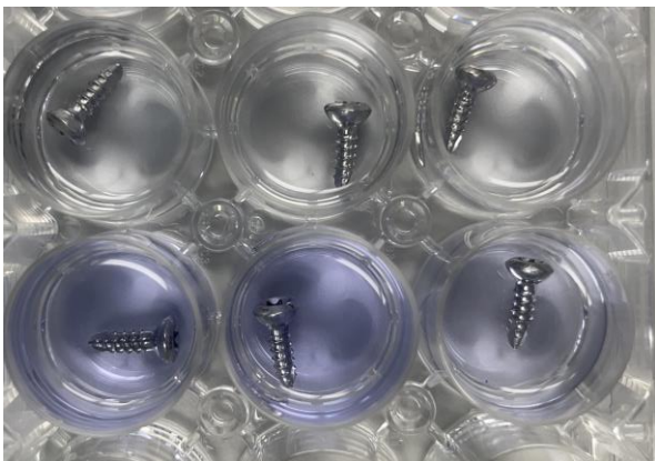
Figure 1: Bromelain powder + scrub treatment group (top row) Resulted in less crystal violet stained residual biofilm versus Control screws (bottom row)