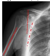
Figure 2. Dashed line: reference line, dotted line: scapular articular surface, solid line: humeral axis