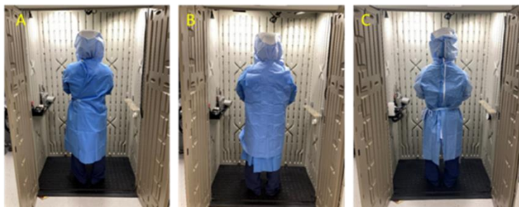
Figure 1. (A) Standard surgical gown with tie back seam (B) Surgical vest over gown back seam (C) Toga zippered seam gown

Simple cost effective variations to standard gowning can greatly reduce the potential of introducing contaminated particles into the sterile field by the surgical team.