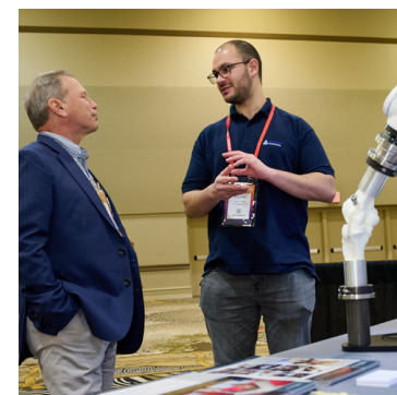
Exhibit at the Annual Meeting

If you or someone you know is a member of an organization that could benefit from showcasing its products, resources, or services in front of 2,500 highly engaged orthopaedic researchers and professionals, there is a great opportunity to exhibit at the 2024 ORS Annual Meeting . The exhibit hall will have regular heavy traffic of researchers, biologists, and engineers who are attending the event. For more information or to book a booth space, please click the link below. Booth selection is on a first come basis.